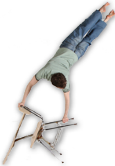
Knowledge - Lessons = Tests? Slippery Rock University