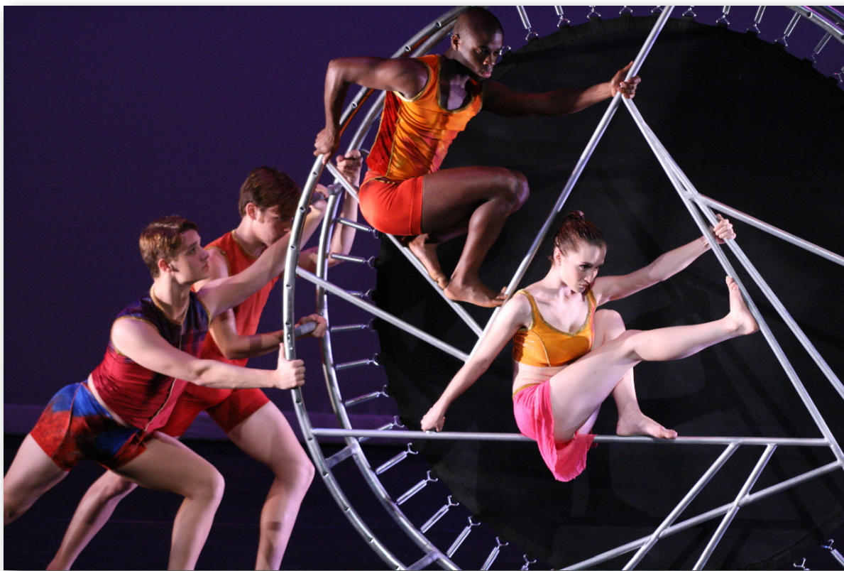
Chakra Kennesaw University

The list goes on and on, and students are a great resource for new ideas and topics. Our participants are hungry for anything you have to share – go for it! Open up that spice cabinet of dance and 'season' away!