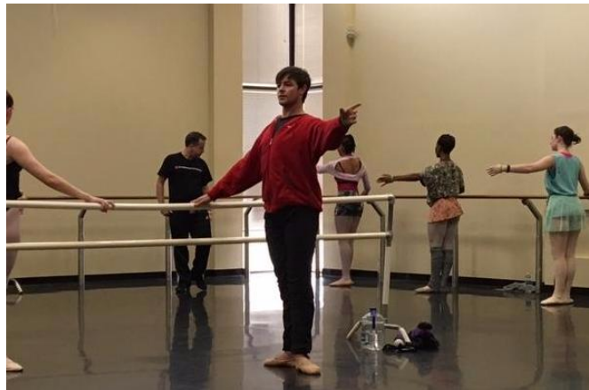
Ballet class in USF's beautiful facilities