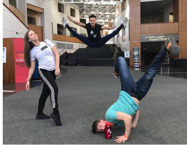
Dancers fill the Performing Arts Center at the University of Maryland