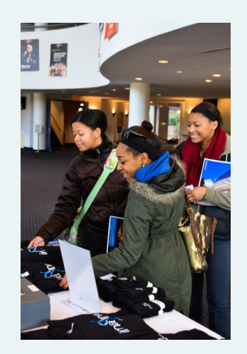
13 conferences getting ready for you

The new year begins with the Baja conference in January, followed by the New England conference in February. March will be our busiest month with 10 conferences being hosted between March 2-27. Conferences end in April with the South conference, then it is off to the National College Dance Festival held at the Kennedy Center in Washington, D.C. from June 6-9, 2018.