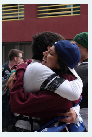
Relationships that last a lifetime

Get registered for what many students (and faculty) have expressed as